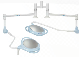
PENTA12+12 | PENTA28+28