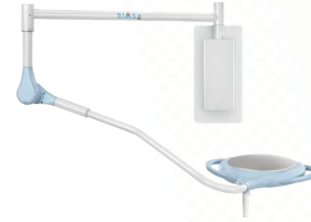
PENTA12PA | PENTA28PA