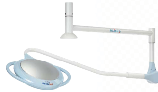
PENTA12SO | PENTA28SO