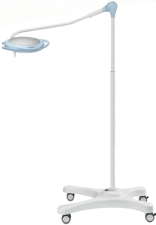
PENTA12PI | PENTA28PI